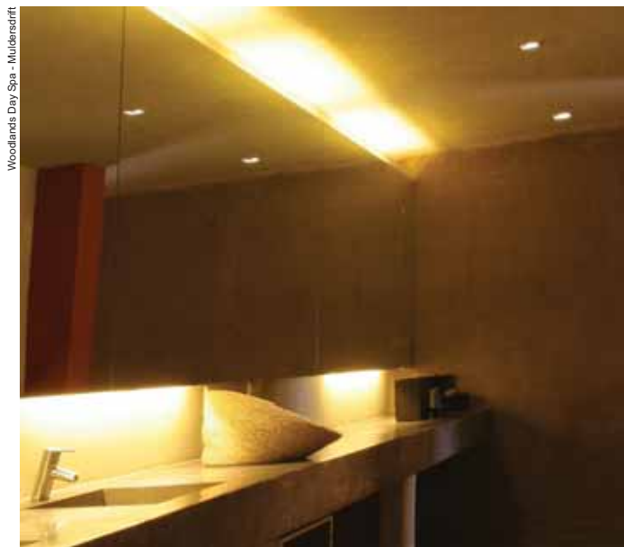
Woodlands Day Spa - Muldersdrift