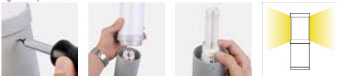
Fig. 1 - Lamp Maintenance